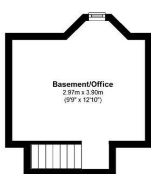
Basement Approx. 14.2 sq. metres (152.5 sq. feet)