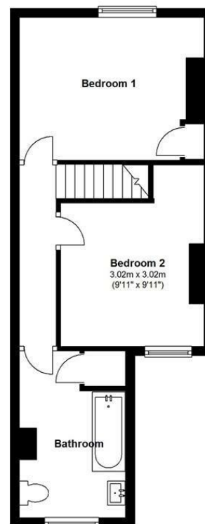
First Floor Approx. 35.1 sq. metres (377.5 sq. feet)

Total area: approx. 87.6 sq. metres (942.4 sq. feet)